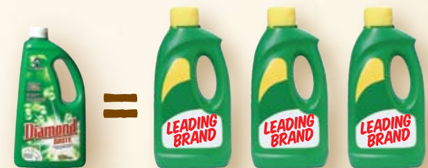
Diamond Brite cleans up to three times as many loads.*