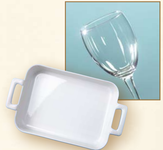
Opti-Shine has three anti-filming agents so dishes shine.