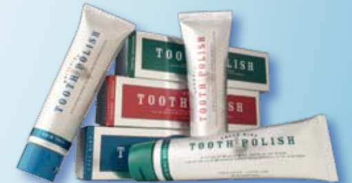
Three Great Formulas: Whitening, Fresh Mint, Classic Cinnamon